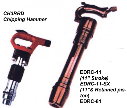
CH3RRD Chipping Hammer