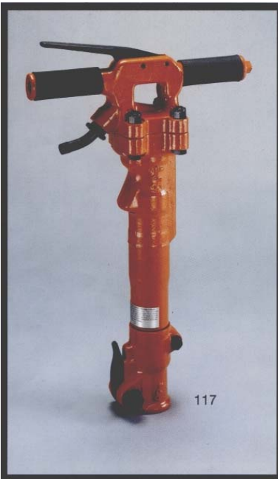
Model 117 - 30 lb. class

Tough and dependable, the high performance model 180 is the most powerful air tool APT makes. It is designed for big jobs such as heavy demolition and concrete breaking. The 160 model paving breaker is a versatile, hard-hitting tool that can be used for medium to heavy demolition work and concrete breaking, and is the perfect all-around breaker. The model 140 is a rugged, yet lightweight paving breaker designed for light to medium construction work. It is ideally suited for plant maintenance work such as light demolition of floors, pavement, frozen ground and masonry walls, and is very popular for bridge deck jobs. The model 140, 160 & 180 standard paving breakers are also available in an ergonomic style that APT calls their Airgo-Line. The model 117, the 30 lb. class paving breaker is the ideal tool for light to medium demolition work as well as for use in confined areas.