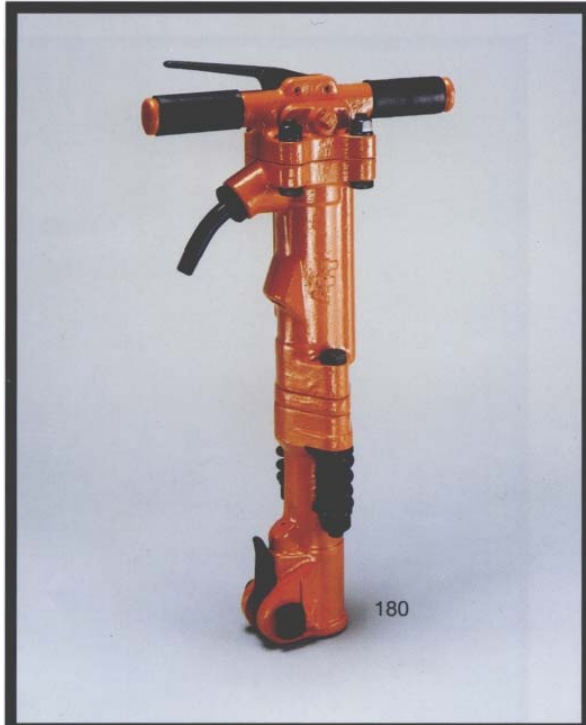
Model 180 -90 lb. class