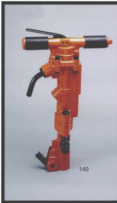
Model 140 - 40 lb. class