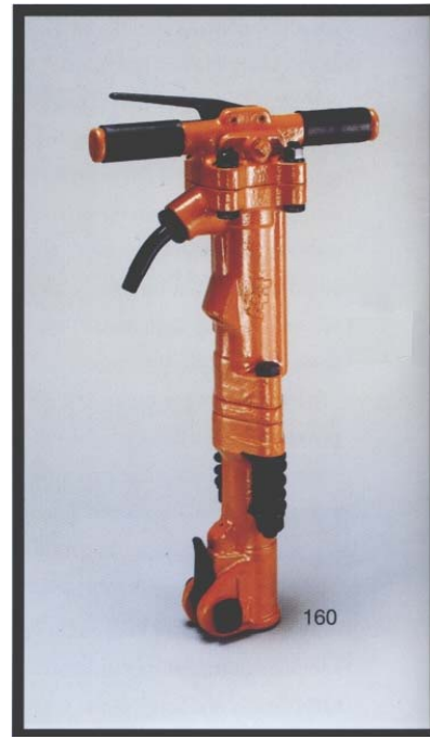
Model 160 - 60 lb. class